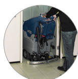
Adjustable and compact squeegee