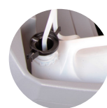
Chemical mixing system