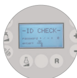
Password for reliability and ease of use