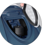
Debris tray + vacuum filter