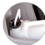
Chemical mixing system