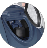
Debris tray + vacuum filter