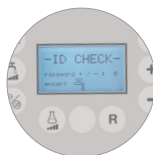
Password for reliability and ease of use