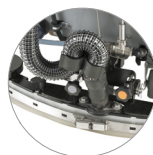
Adjustable and compact squeegee