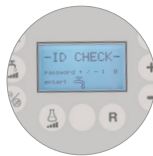
Password for reliability and ease of use