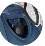
Debris tray + vacuum filter