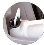
Chemical mixing system