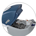
Tiltable recovery tank