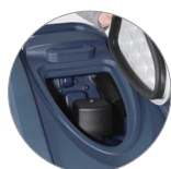
Debris tray + vacuum filter