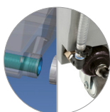
"Built in" solution tank filter