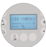
Password for reliability and ease of use