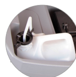
Chemical mixing system