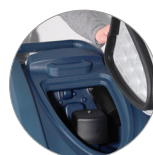
Debris tray + vacuum filter