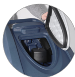
Debris tray + vacuum filter