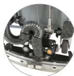
Adjustable and compact squeegee