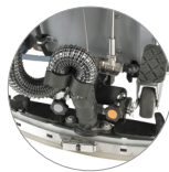
Adjustable and compact squeegee