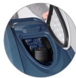
Debris tray + vacuum filter