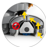
Alternate twin squeegee system (patented)