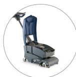
Easy to transport, park, store