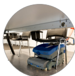
Fast and easy maintenance