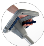
Ergonomic handle with unlocking system