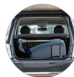
Easy to transport, park, store