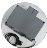
Power supply kit case