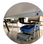
Compact dimensions to go and work where no one arrives