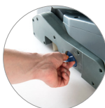
Adjustable down pressure by knob (3 steps)