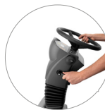
Adjustable steering wheel