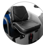
Adjustable and ergonomic seat