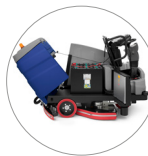
Immediate opening/ access to all the main components