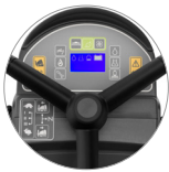
Control panel with display