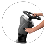
Adjustable steering wheel