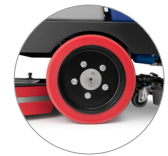
Traction on rear wheels (RD versions)