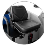
Adjustable and ergonomic seat