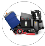
Immediate opening/ access to all the main components