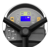
Control panel with display