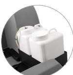
Chemical mixing system