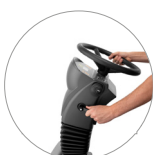
Adjustable steering wheel