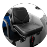
Adjustable and ergonomic seat