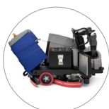
Immediate opening/ access to all the main components