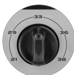
Different diameters of selectable accessories