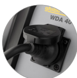
Power tool connection