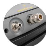
COMBI Kit (optional)