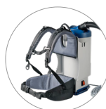
Comfortable shoulder straps