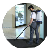
Light and comfortable