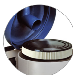
HEPA Cartridge filter (optional)