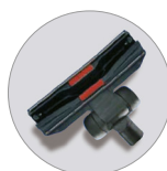
Floor tool RD 285