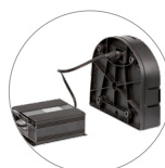
Chargers and batteries