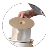
Fleece filter bag and textile filter