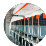
Ideal for airplane cleaning