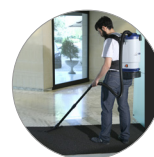
Light and handy