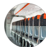
Ideal for airplane cleaning