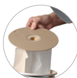
Fleece filter bag and textile filter