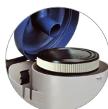
HEPA Cartridge filter (optional)