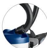
Flexible tube coupling