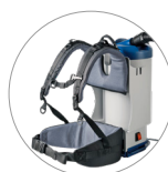
Comfortable shoulder straps